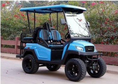
SLOW SPEED VEHICLE

There are driver restrictions on driving all carts on the road.